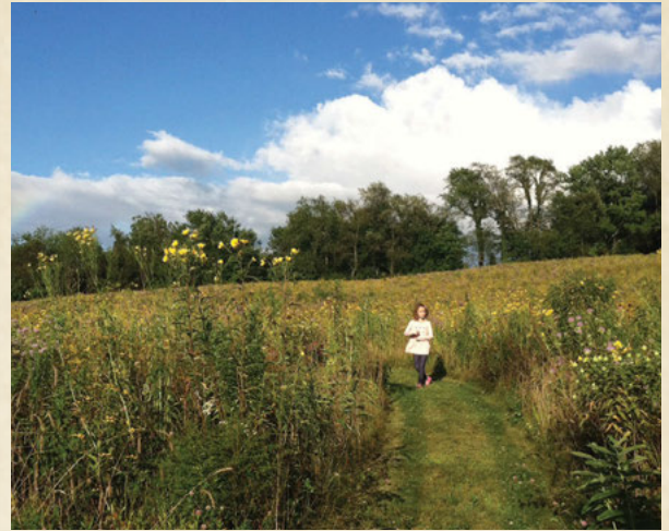
Earlier this year the North Central Ohio Land Conservancy received a $20,000 Foundation grant to purchase 23 acres of land to complete an extended trail system in the Clearfork River Valley for use by the general public. This photo shows the beauty of the land in southern Richland County.