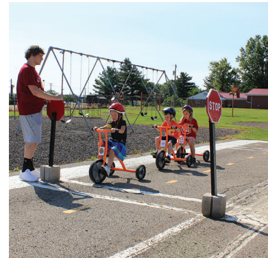
The grants of up to $2,500 were given to support creative, educational and fun-filled activities . Photos L- R: Mankind Murals, Renaissance Theater Camp, and Shelby Safety Town children.